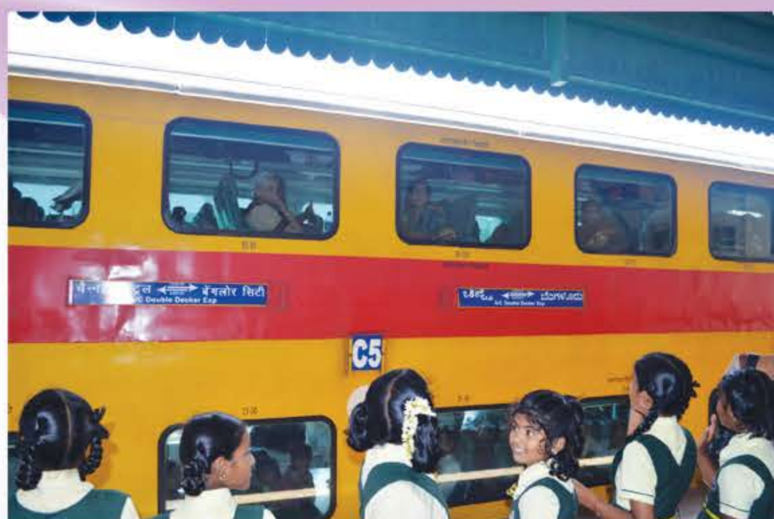
With Double Decker Train