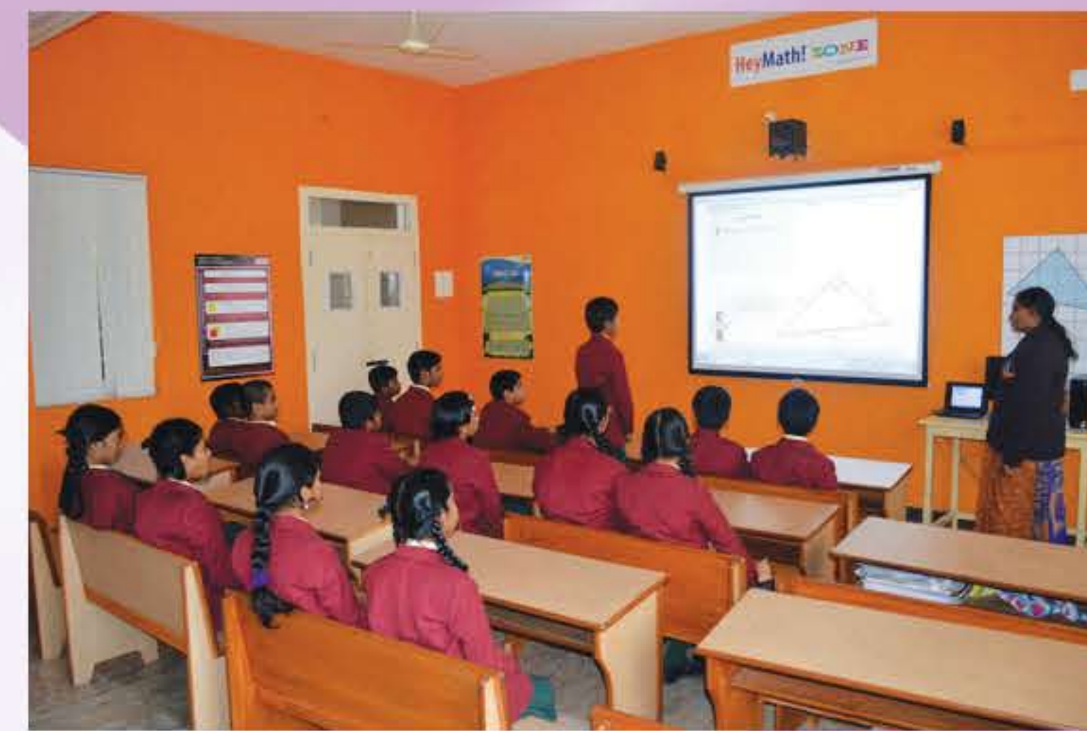
Hey Math! Lab