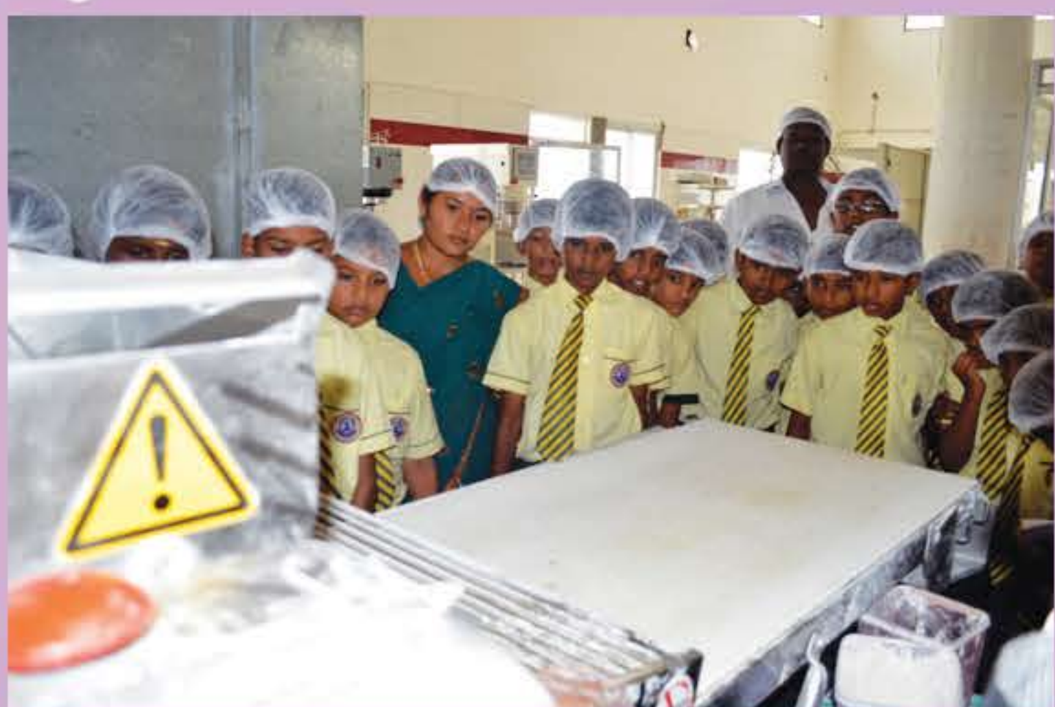
Learning to bake