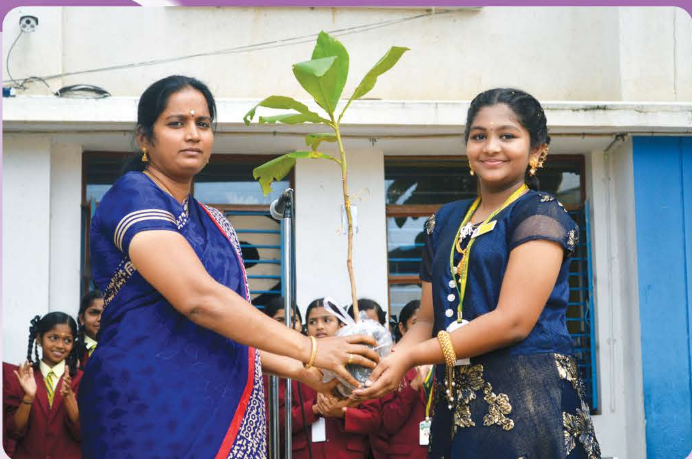
Gifting Sapling to School