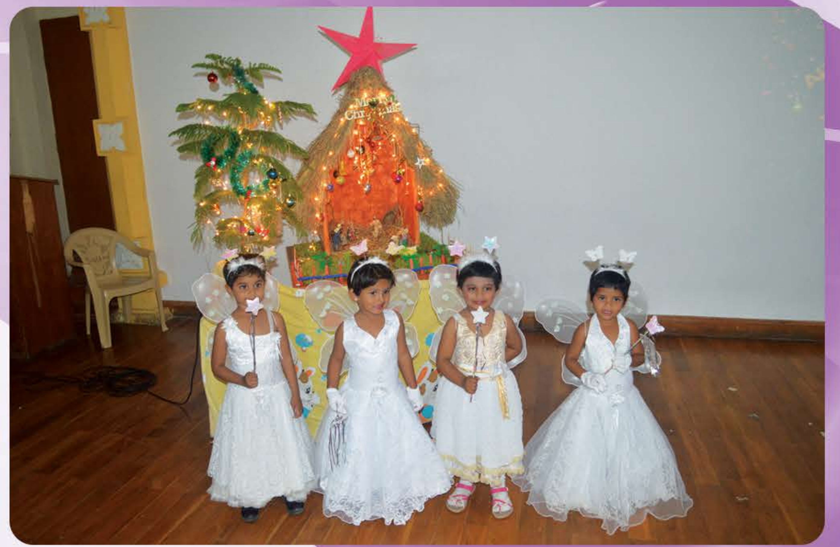
Christmas Day Celebration