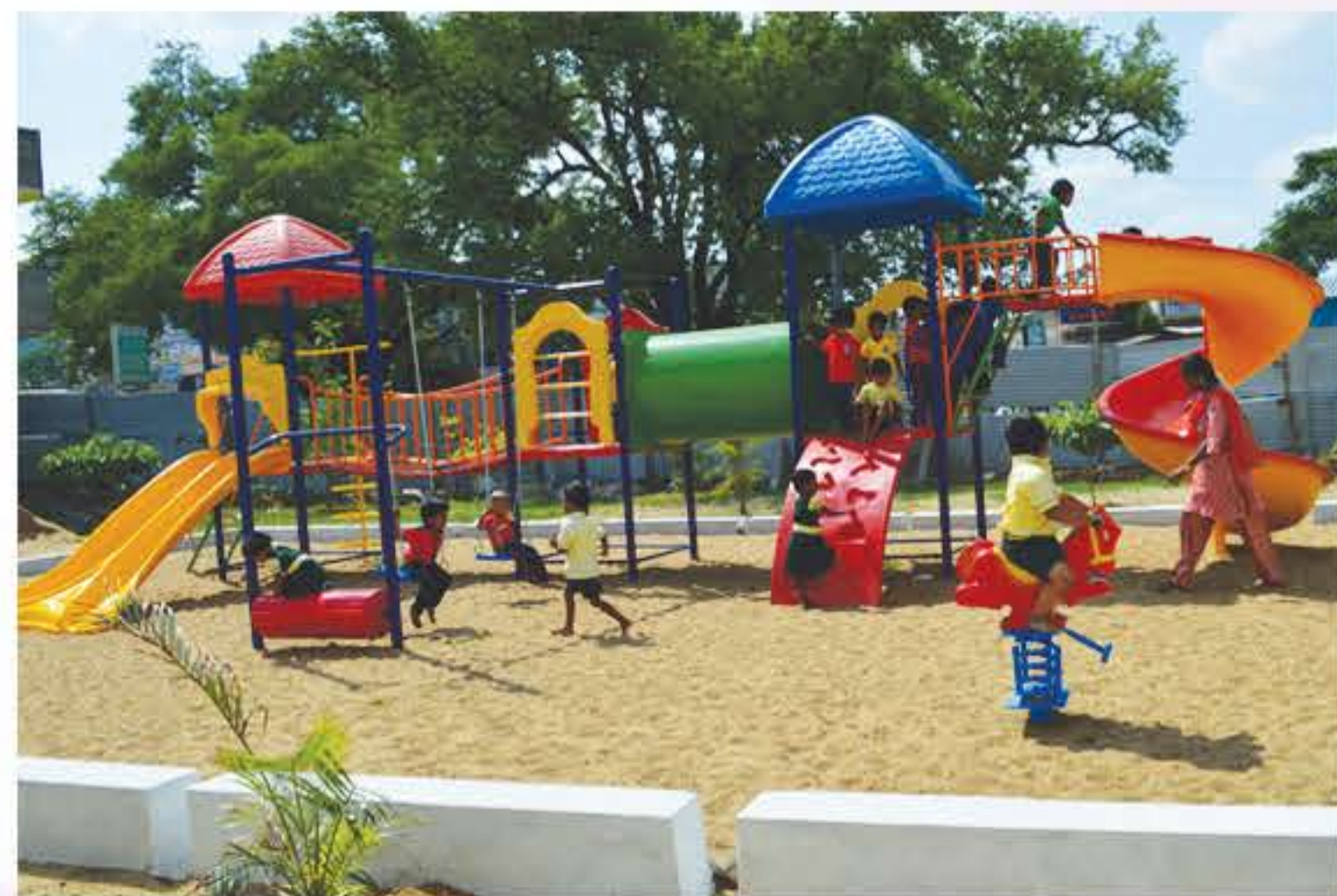
K.G. Play Area