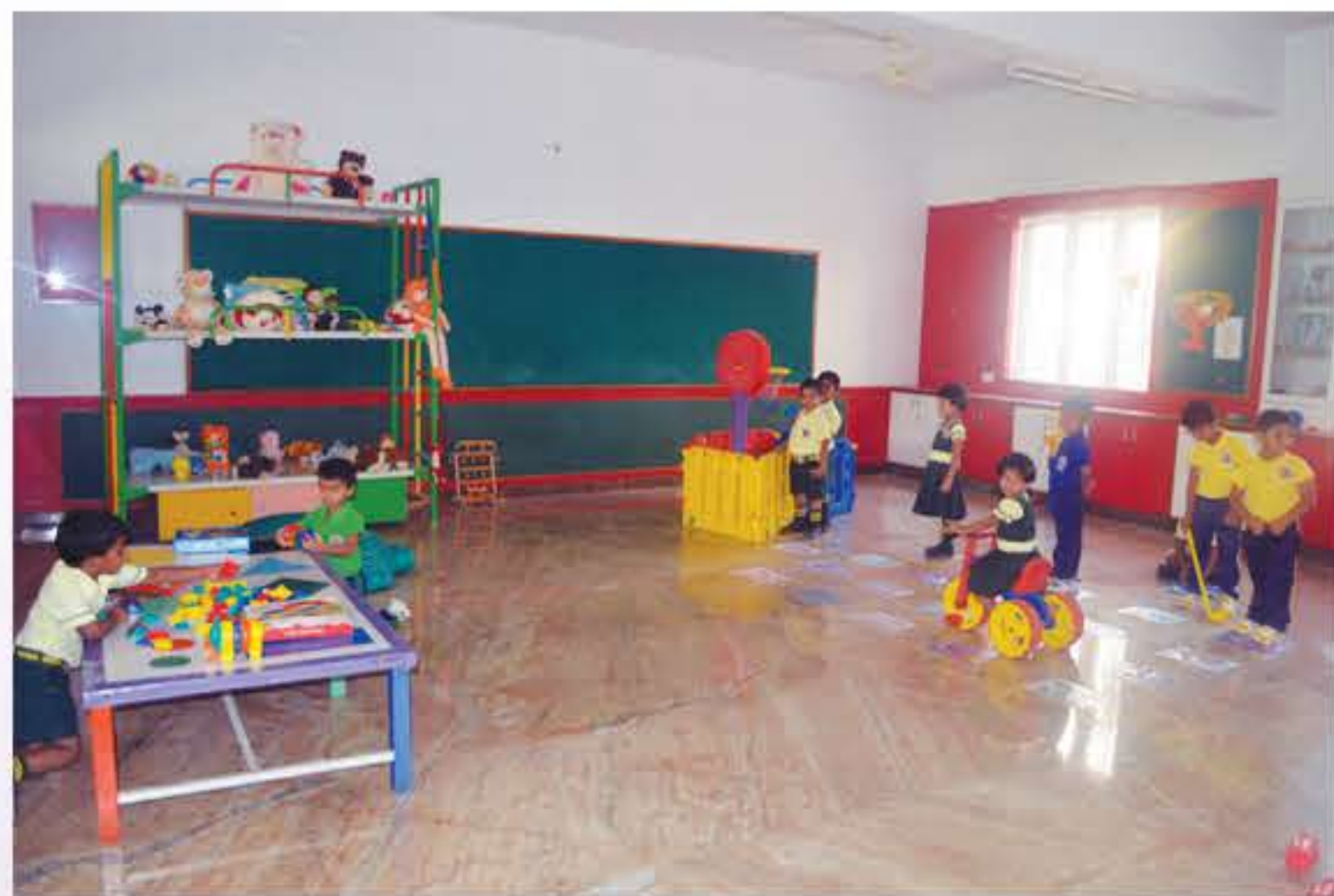
K.G. Play Room