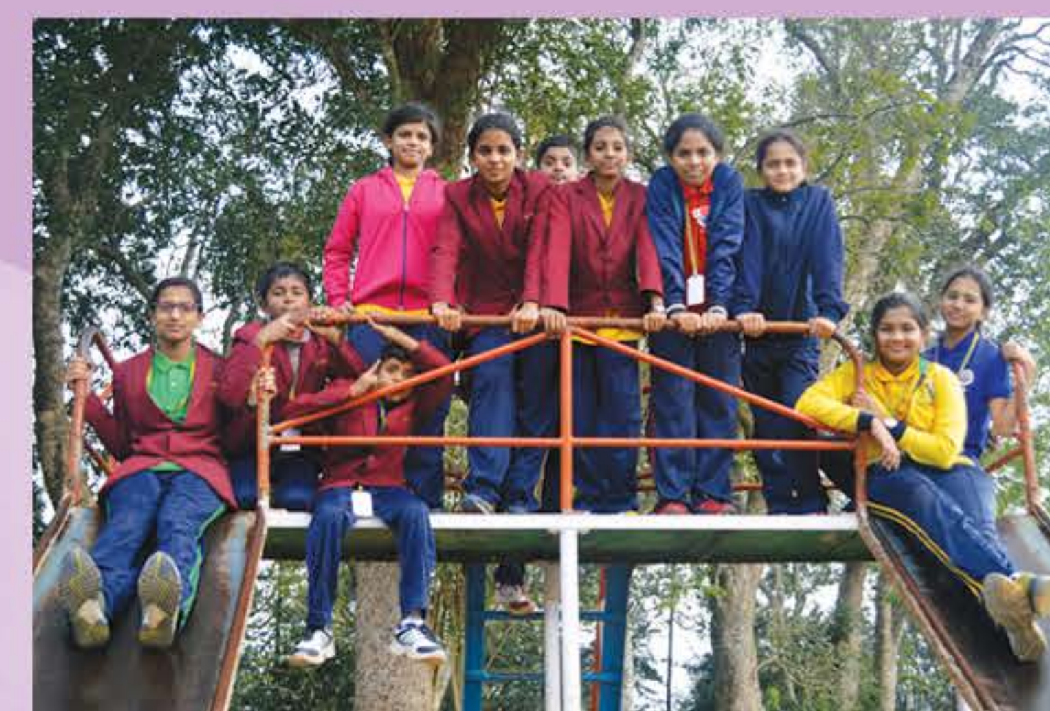
Field trip to Yercaud